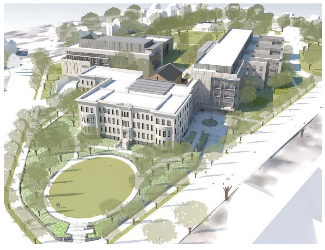
Washington College of Law – Tenley Campus