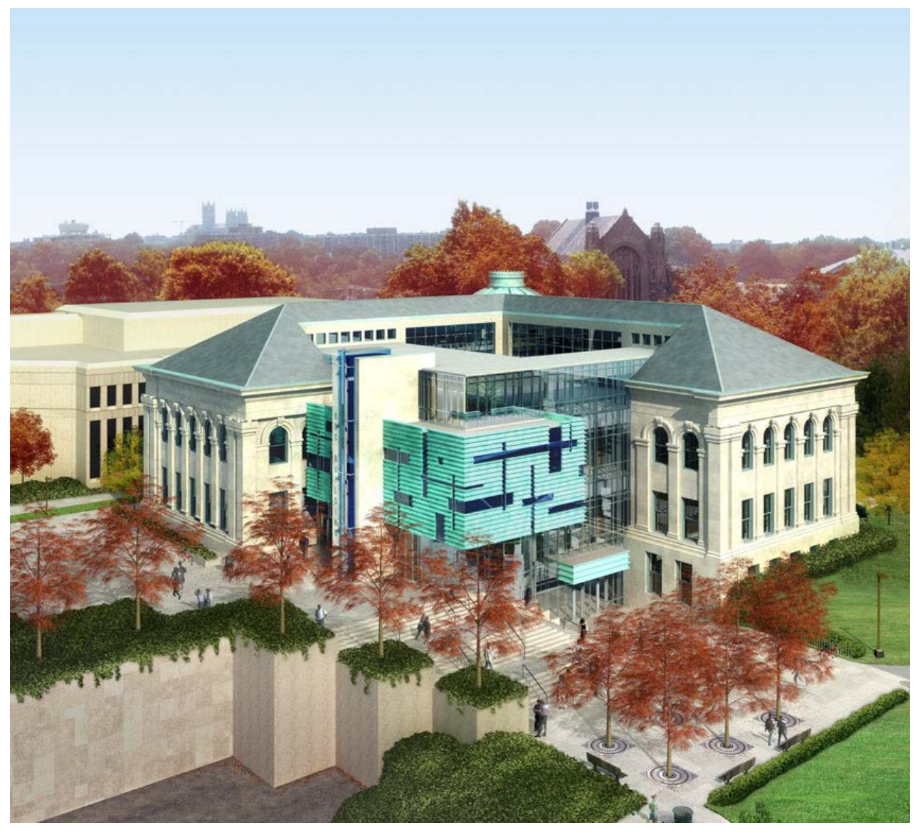
McKinley Building – School of Communications