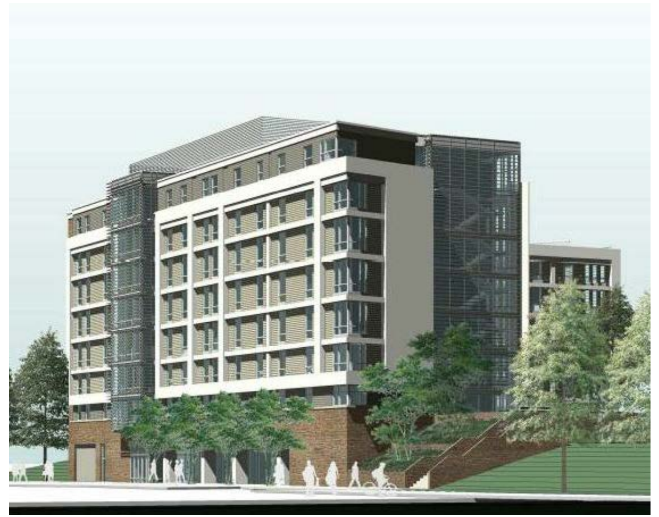
Chapter 3 — Addenda / Forms