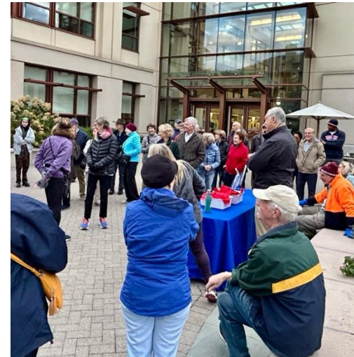
Oct: Arboretum Full Moon Campus Tour