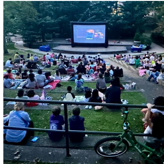
Sept: Neighborhood Movie Night