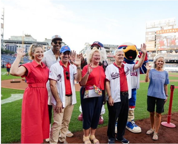
August: AU Day at the Washington Nationals