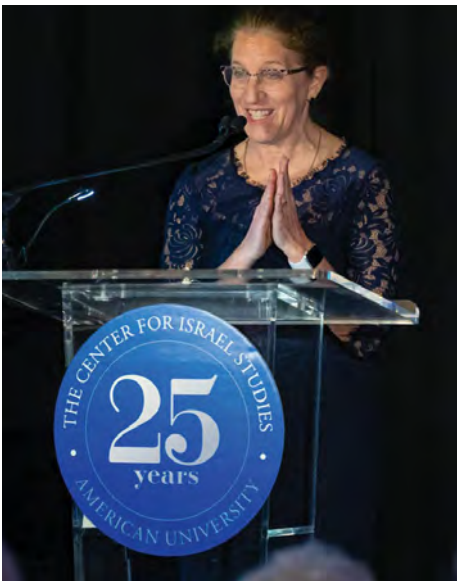
AU President Sylvia Burwell